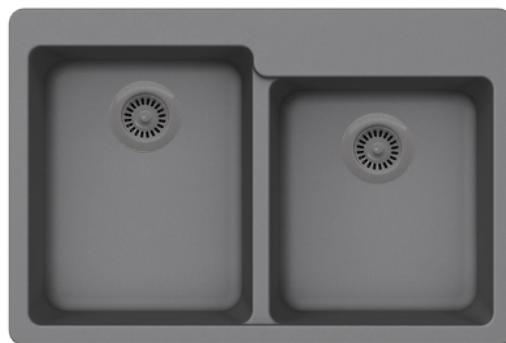
Color Pictured: Chroma *Pictured with Matching Chroma Strainers